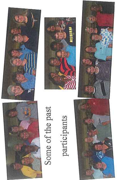
Some of the past participants